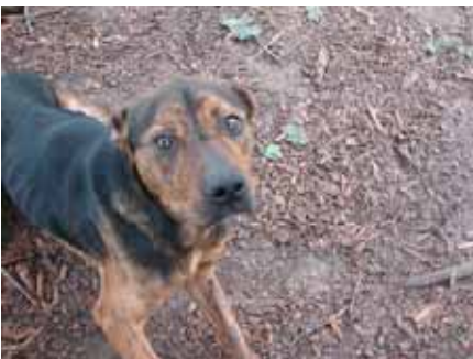
Cookie came to us emaciated, neglected and abused.

Cookie was a stray who came to us neglected and abused. She was emaciated and one ear was mostly chewed off. However she was the sweetest dog you would ever meet. After weeks of rehabilitation and TLC, we made her pet of the week and a wonderful family adopted her.