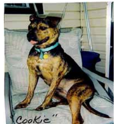
Here is Cookie today,

Please fill out the enclosed envelope if you would like to support animals like Cookie.